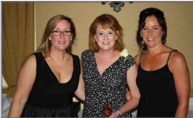
IREM 54 wins REIC Community Services Award

This Community Services Award honours the chapter and/or member that have demonstrated an outstanding commitment to the local community, through volunteer services and charitable work, within the chapter's jurisdictional boundaries. Thank you everyone who supports the JDRF Golf Tournament and the Fusion Kitchen Charity at our Christmas luncheon.